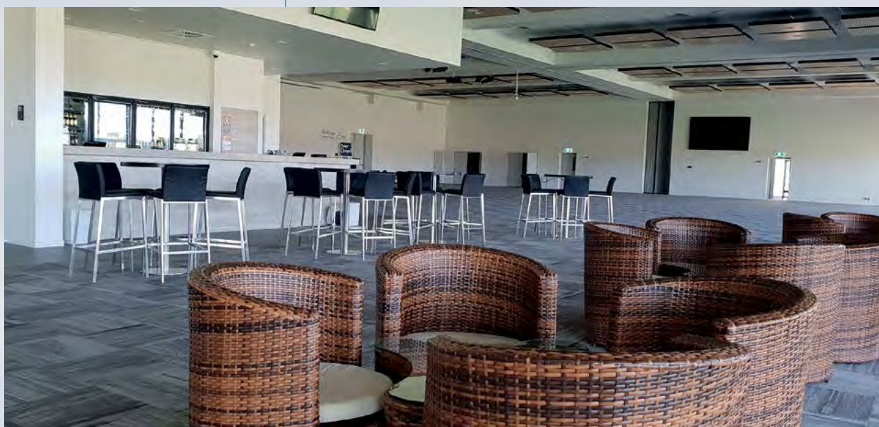
Inside The Range Function Centre