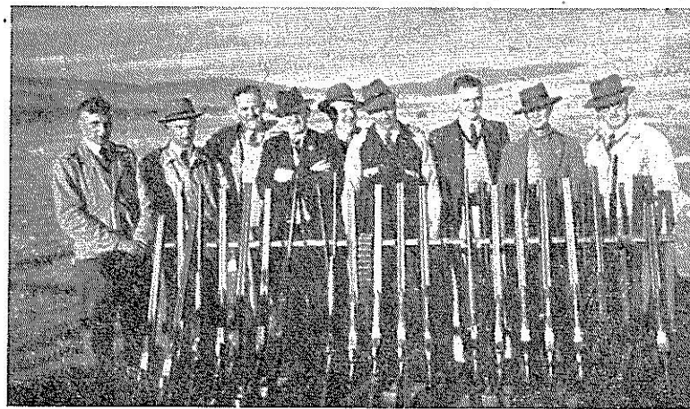
Some of the visiting shooters at the Tasmanian Double Barrel Championship at Hobart.

"News" is obviously already popular. The Association hopes that shooters by their support will continue to make it worthy of the high reputation borne by clay pigeon shooting sportsmen.