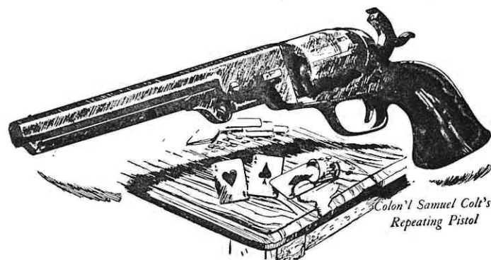
Colon'l Samuel Colt's Repeating Pistol