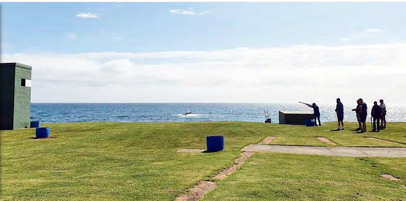
The Burnie Clay Target Club skeet championships layout

Thank you to shooters and their families who came along, you all made it a fantastic day at the Club. Congratulations to our winners. We look forward to seeing everyone again soon at the BCTC!