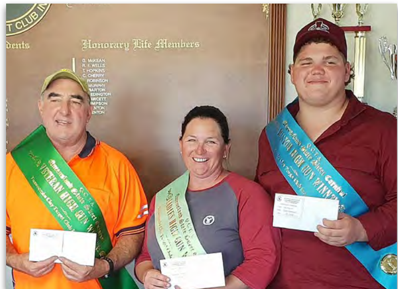
Section High Gun winners