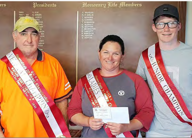
20G Section winners