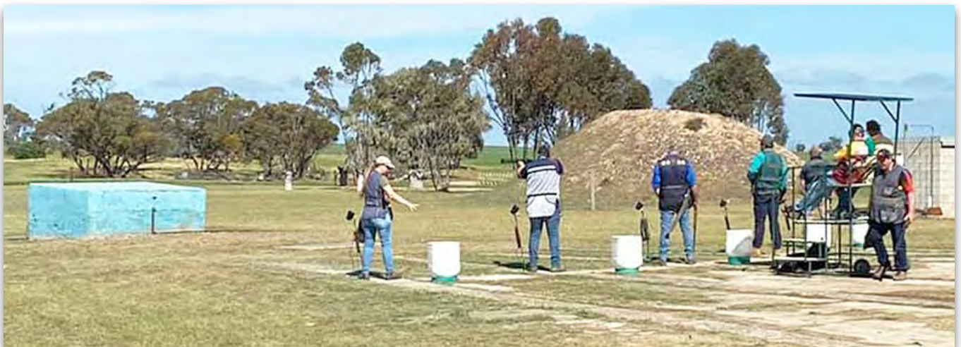
Day 1 Competition