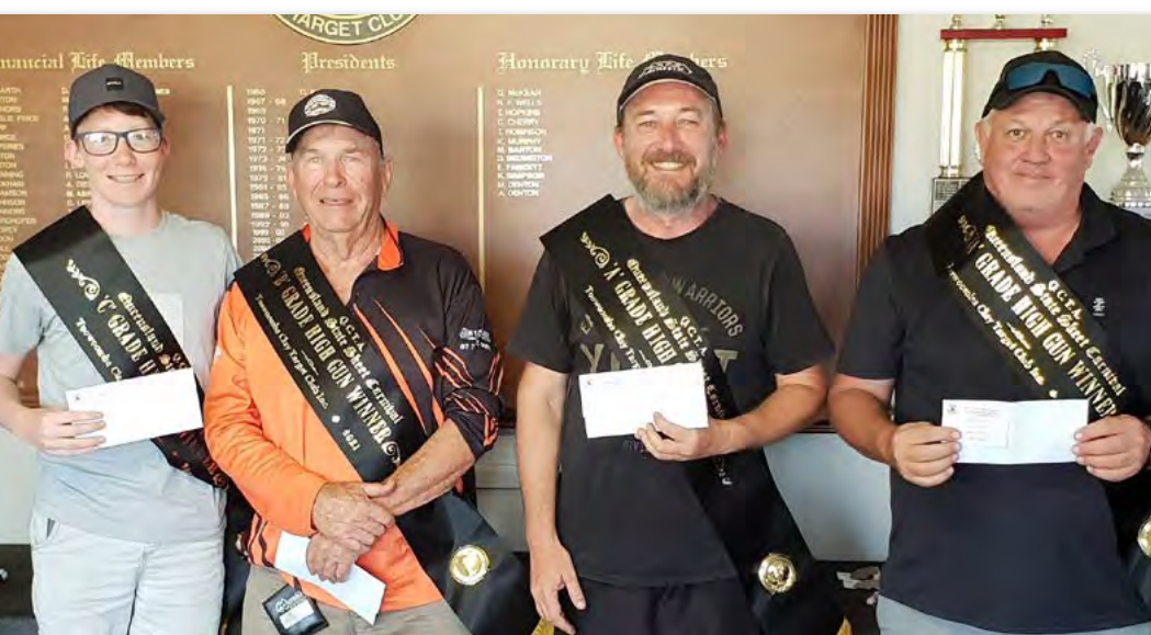
Grade High Gun winners