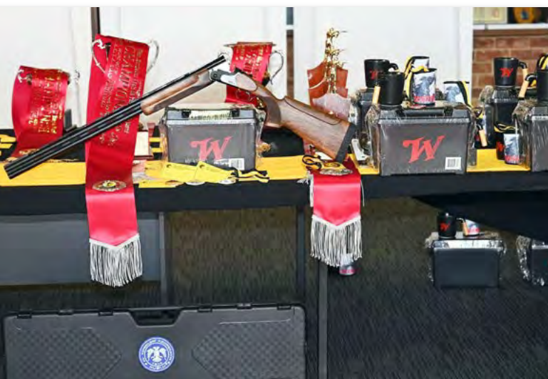
Winchester Trophy Table