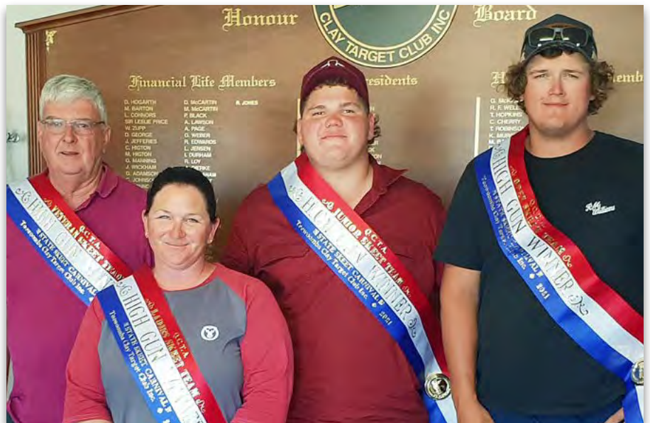
Team High Gun winners