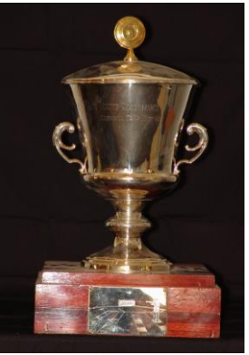
Newton Thomas Cup