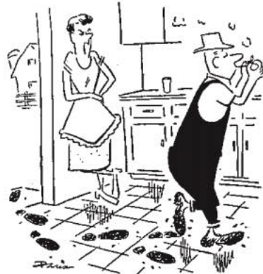
"Your shoe is untied."

Some men work hard and save their money so that their sons won't have the problems that made men of their fathers.