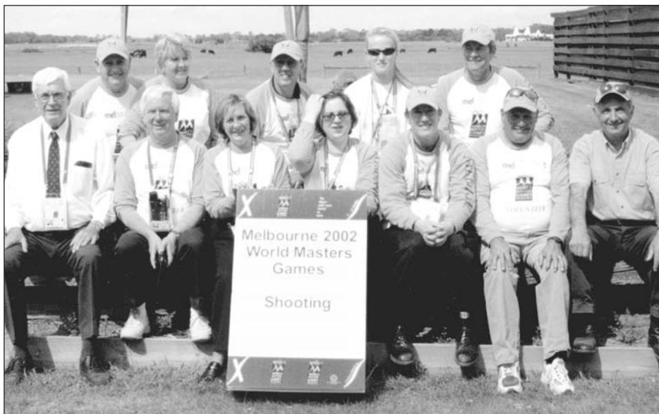
2002 WMG Information Staff, WMG Liaison Officer, Medical Staff, Medal Presentation Officials and Shoot Administrators.