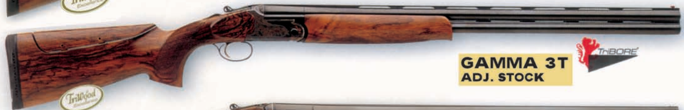
GAMMA 3T ADJ. STOCK