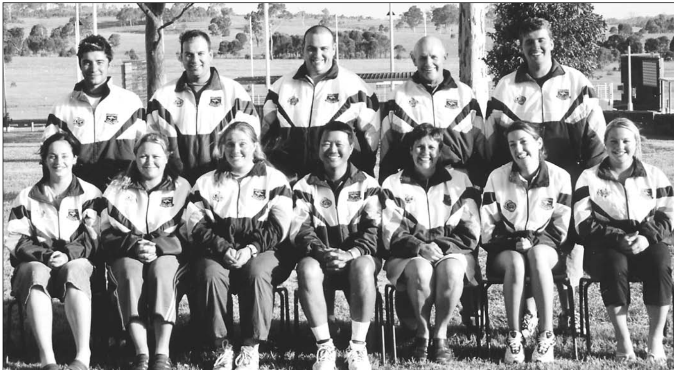
Sydney World Cup Team - Australian Trap Team.

Having just completed the Olympic selection trials on the same