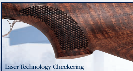
Laser Technology Checkering