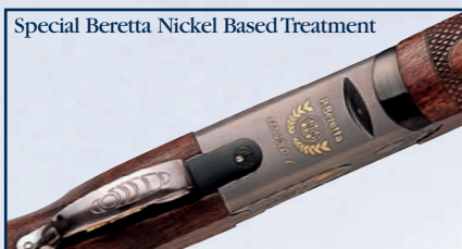
Special Beretta Nickel Based Treatment

All models are available with memory system adjustable stock or standard stock.