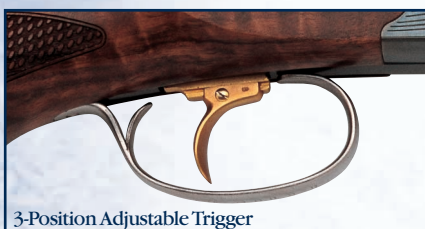
3-Position Adjustable Trigger