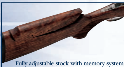
Fully adjustable stock with memory system