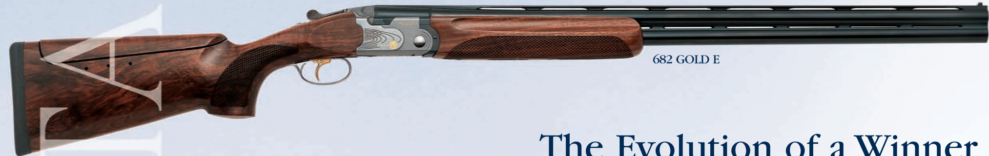
682 GOLD E