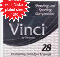
Vinci 28 1300 FPS 5% Antimony 7.5