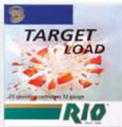
Target Load 1220 FPS 3% Antimony 7.5 , 8 , 9