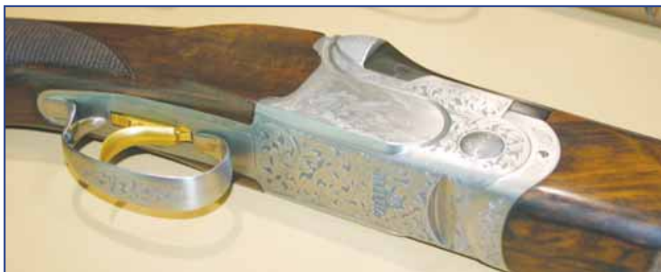
More engraving about the receiver of the DT 10 Trident shotgun. Note the excellent metal finish and high quality walnut stock work of this premium grade model from Beretta.