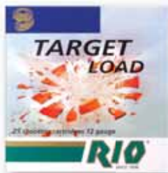
Sub Sonic 1070 FPS 3% Antimony 7.5 , 9

As the world's largest manufacturer of shotgun ammunition, it may not surprise you to learn that we have the largest range of 28 gram shells.