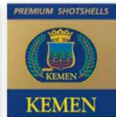
Kemen Extra 1280 FPS 5% Antimony 7 , 7.5 , 8