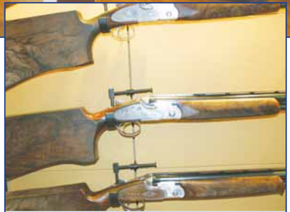
A close-up of the receivers of the SO, (side lock), series of Beretta shotguns including the magnificent Beretta SO 9 with its hidden action pins.