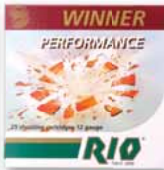
Winner 1200 FPS 3% Antimony 7.5 , 9