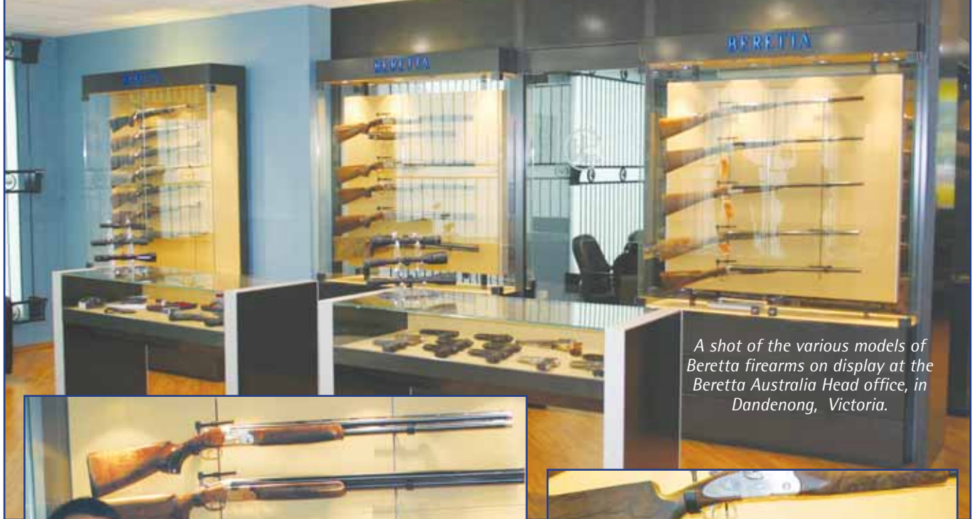
A shot of the various models of Beretta firearms on display at the Beretta Australia Head office, in Dandenong, Victoria.