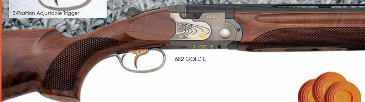
682 GOLD E