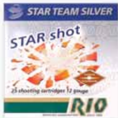
Star Team Silver 1350 FPS Diamond Shot 7.5