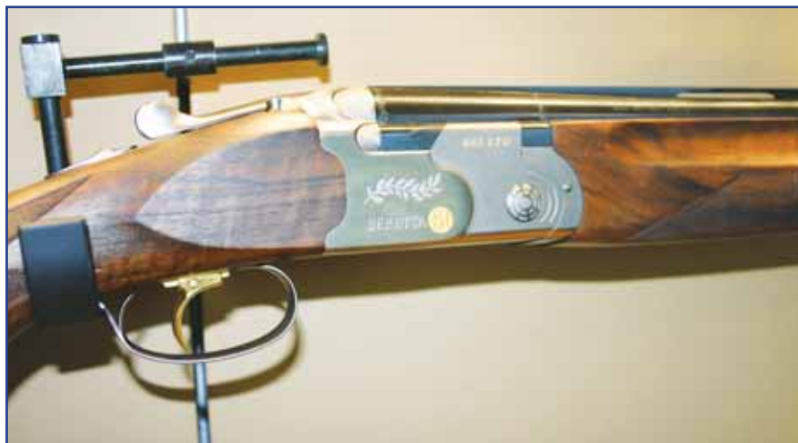
One of the limited edition Beretta 682 shotguns available throughout the world-wide network of Beretta distributors.

superior finish. As well as the trap model it is available in a skeet or sporting version with the 'optima bore' system of over-boring credited with improved shot patterning, reduced perceived recoil and shot velocity optimisation. There are special chokes also designed for Optima models, both, fully internal or Extended Optima chokes - as preferred. The DT 10 Trident moves away from the conical locking lugs that lock the box lock range of guns and utilises a proven "Boss" system whereby a cross-bolt locks barrel extensions in place. The adjustable stock with memory system is also available. The gun is available in either a very deep blued colour approaching black or Beretta's special grey "electroless" nickel finish. A variety of rib types and barrel lengths are also available to order.