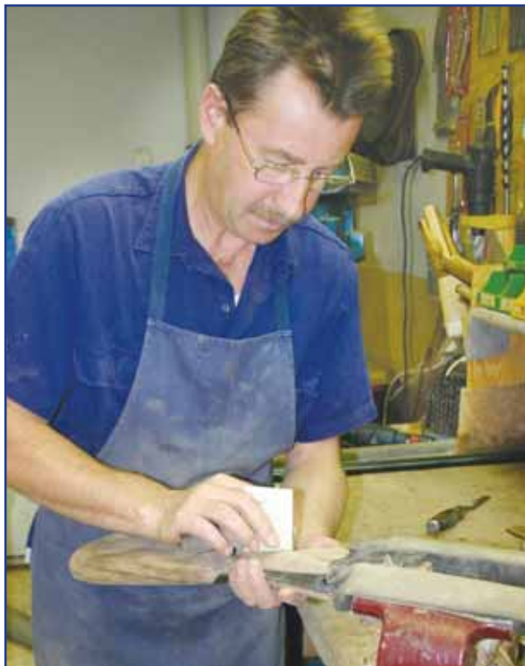
A high quality Beretta SO model with its inletted stock ready to be prepared for the discerning shooter who appreciates the quality, balance and performance of premium-grade, custom-made sporting arms.

available for the hunter. They are priced around the $2,700 mark and offer an excellent entrance price for any of the clay target disciplines. Of particular interest during my visit to Beretta Australia was the 686 E Trap with its raised competition rib, so that you can see the target at all times. This was also available with the stock memory system, an adjustable system that enables the shooter to set the stock comb at the precise height and cast-off to suit. Barrel length is 30" with skeet and sporting versions available in 28" or 30" interchangeable or fixed chokes.