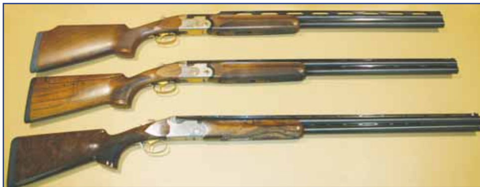
The three progressive grades of trap guns produced by Beretta from top; the 686 with its high competition rib, centre; the 682 Gold E with Optima bores and at the bottom; the DT 10 Trident. Note the increased character and quality of the increasing grades of competition guns as they move from top to bottom.

The basic competition model Beretta in an under and over configuration is the 686. This model, as with other higher grade models, is available in trap, skeet and sporting with field grades also