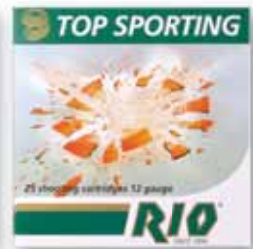
Top Sporting 1280 FPS 5% Antimony 7 , 7.5 , 8