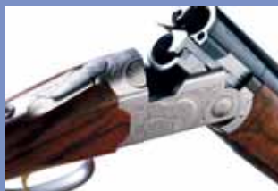
Patented locking system.