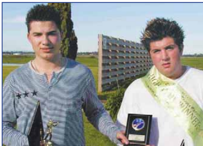
Jnr Team Werribee