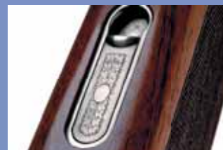
Maximum attention to every detail.

We thought we couldn't do anything better. We thought perfection is one time only. But for Beretta perfection is a challenge, and can always be improved. That is why we produce the best shotguns in the World since 1526. That is why we brought back the Silver Pigeon S, this time in 2 different versions: Trap and Sporting.