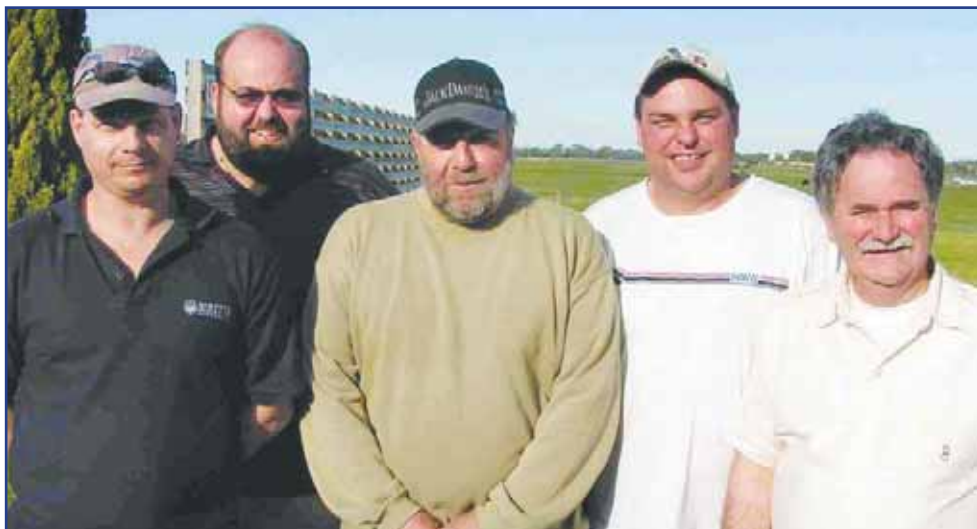
Winning Team Melbourne