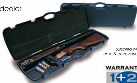
Supplied with case & accessories.