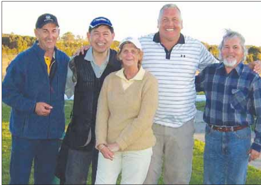
The Squad on the day