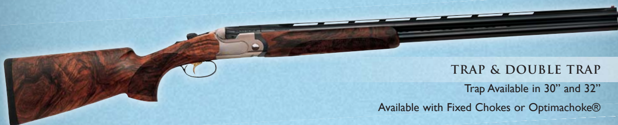
TRAP & DOUBLE TRAP