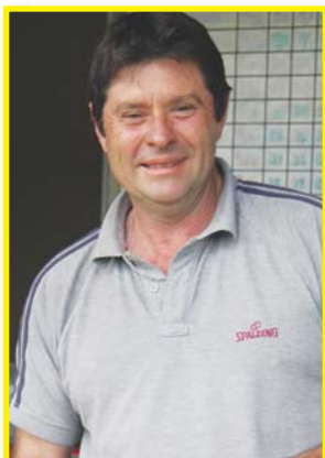
Craig Field B Grade PS, SB, 2nd 50T Continental