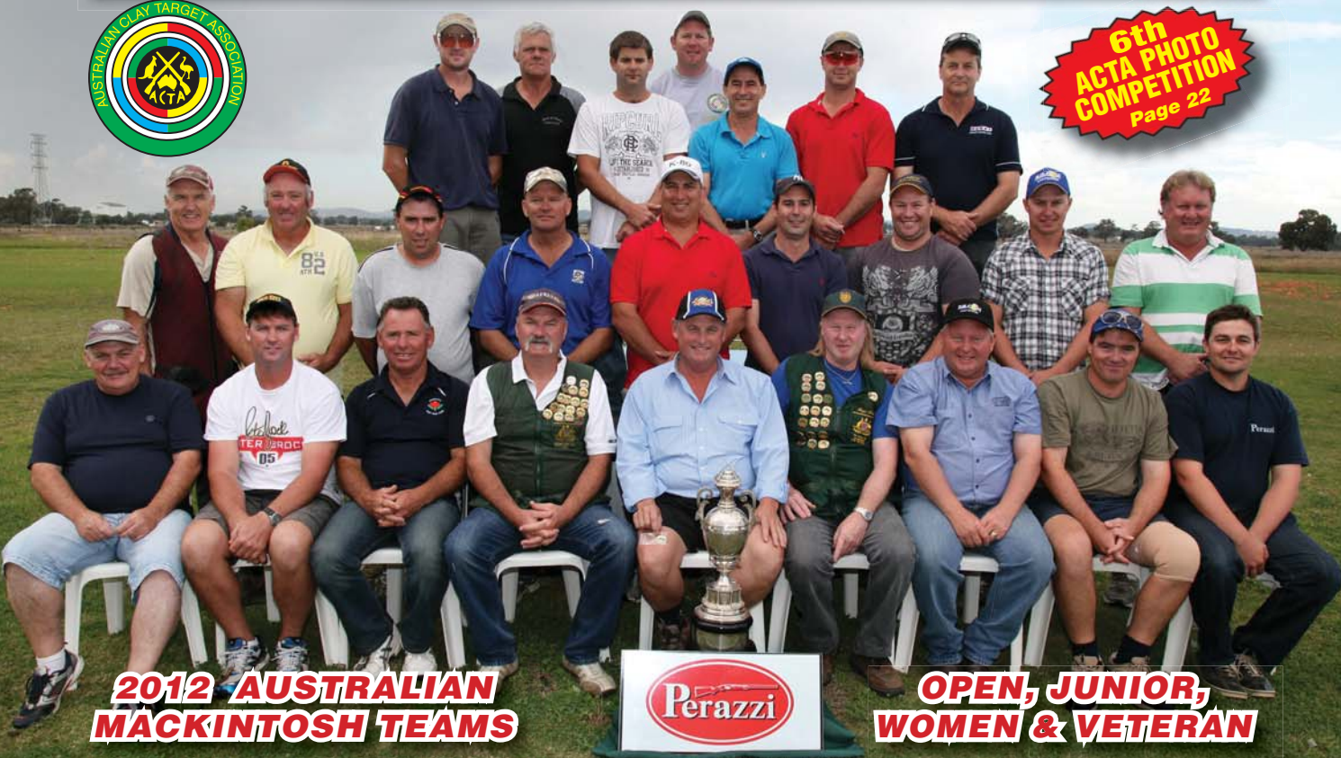
2012 AUSTRALIAN MACKINTOSH TEAMS