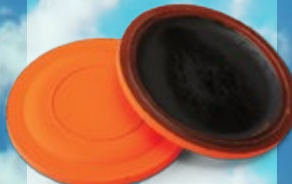
BATTUE - ORANGE