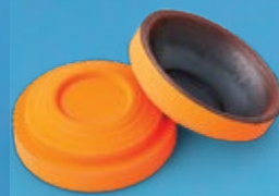
MINI - ORANGE