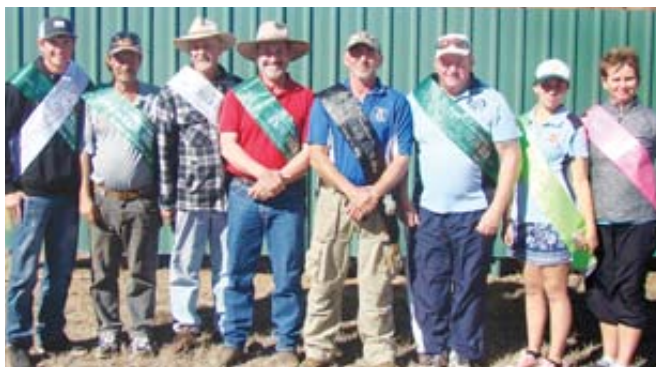
High Gun winners

With 40mm rain received in a 24hr period commencing Friday, the conditions for Saturday were not the greatest for shooting. It was overcast, cold and wet. Sunday whilst sunny was still cool and windy. There were still 27 possibles on the board for the week end.