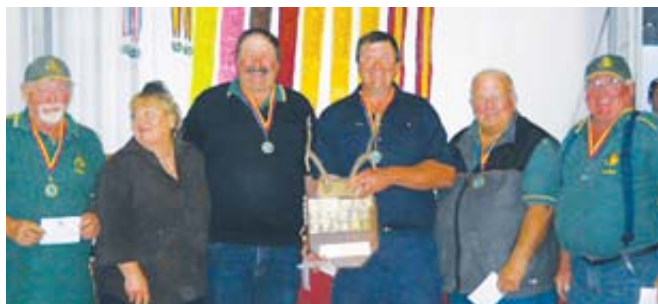
Day 1 Team Shoot, Wilkawatt winners