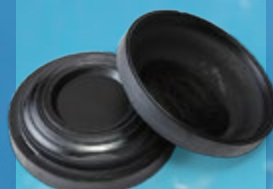
MIDI - BLACK