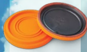
RABBIT EXTRA - ORANGE