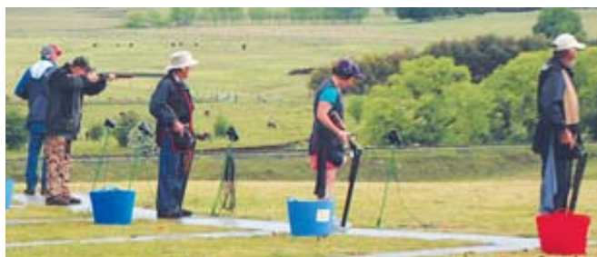
Shooters in action