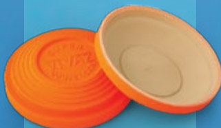
STANDARD NATURAL - ORANGE