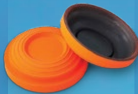
MIDI - ORANGE