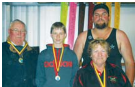
Day 2 OA, Veteran, Junior & Ladies High Guns