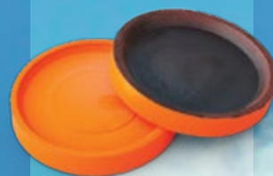
RABBIT - ORANGE