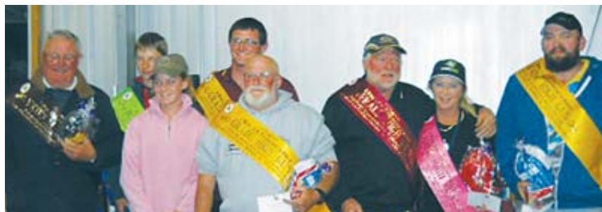
Winners of 2 day High Guns & Grade High Guns