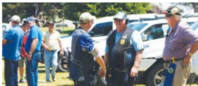
Shooters analysing the last event