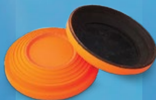
STANDARD FLASH - ORANGE