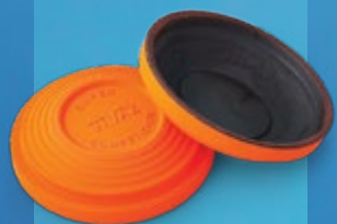
STANDARD - ORANGE