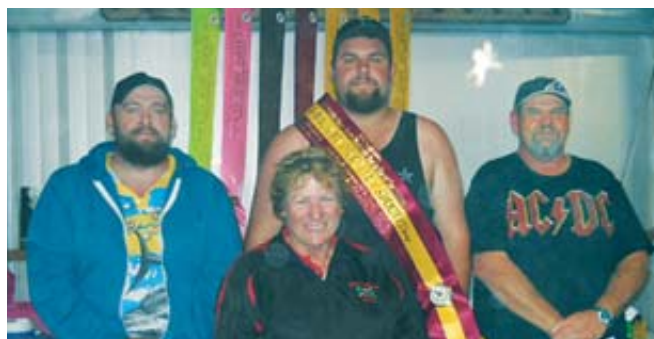
Day 2 50T DB 1st place winners

The final event for the weekend was shot in conjunction with the