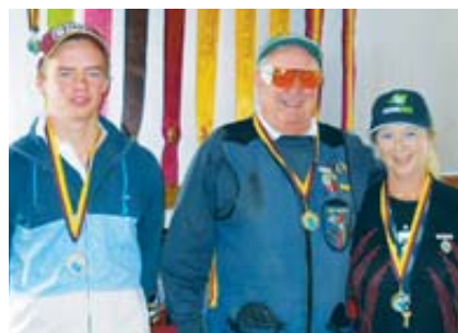
Day 1 OA, Ladies, Veteran & Junior High Guns