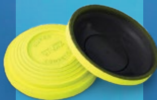
STANDARD - YELLOW