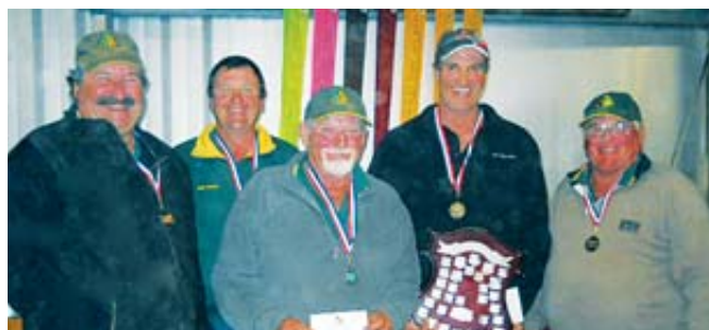
Day 2 Team Shoot, Wilkawatt winners