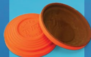
ECOSTAR - LIGHT ORANGE