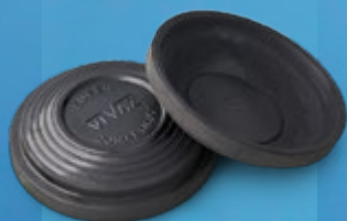
STANDARD - BLACK

With unrivalled quality and an extensive range, why not SMASH a box today?