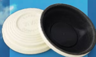
STANDARD - WHITE