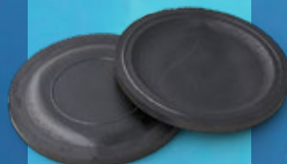
BATTUE - BLACK