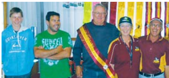
Day 1 50T DB 1st place winners