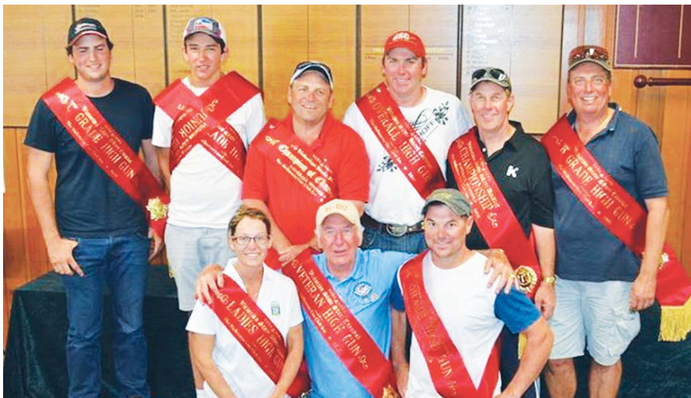
All HG winners