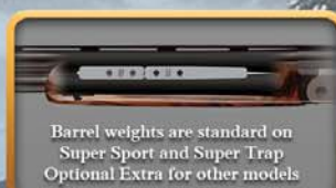
Barrel weights are standard on Super Sport and Super Trap Optional Extra for other models