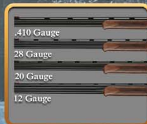
Retrofit Interchangeable Barrels