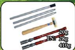
SIDE KICK SETS