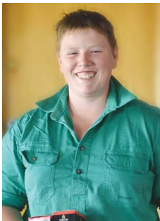
Jack Werner Encouragement Award

Finally, Event Three, the last event, a 20 Pair Deauville Doubles Championship, shot off the eighteen metre mark and although virtually everyone entered the event, most must have been thinking about being behind their usual meterage, as there was only one pair of shooters able to put their hands up to claim the pair of Overall Winners Sashes, and they