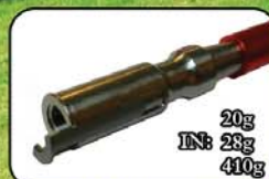
FULL LENGTH DROP IN TUBE SETS