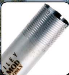
THIN WALL CHOKES