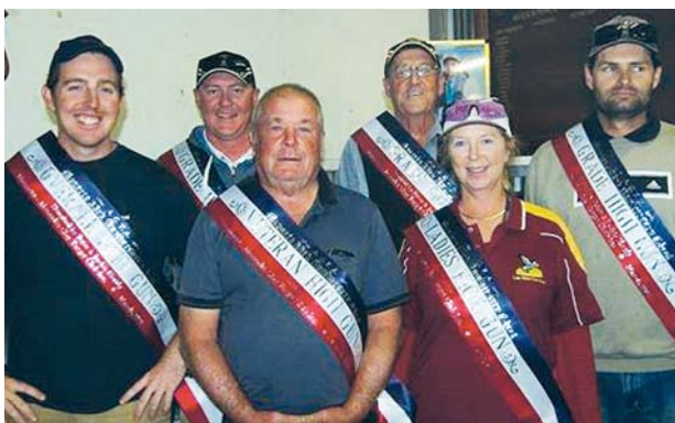
Happy HG winners