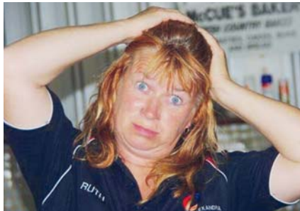
Have we got enough food