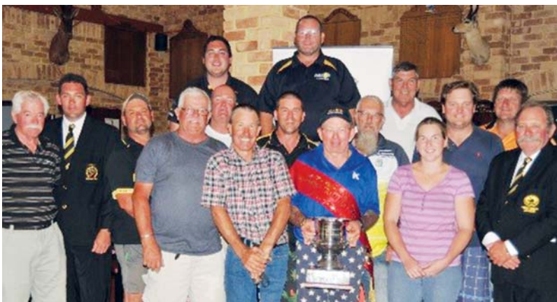
Open State Team Members

As the day drew to an end the 50 State Skeet Handicap event was shoot