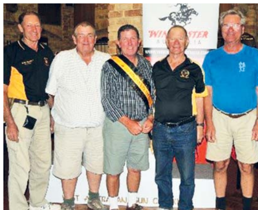
Veterans State Team Members