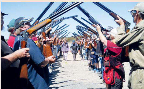
Walking the parade of honour