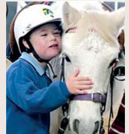
One of the young RDA participants

Cowra Gun Club Inc. hosted a successful charity shoot on Sunday March 29 to raise awareness and funds for Cowra Riding for the Disabled and all profits from the day went directly to this small but wonderful organisation.