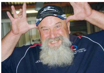
A mad moment before his finger was bitten by his gun