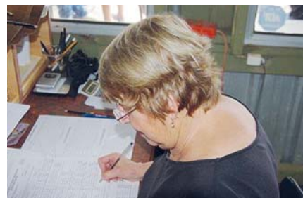
Hard at work in the office

running smoothly so we were able to finish before 4 each afternoon.