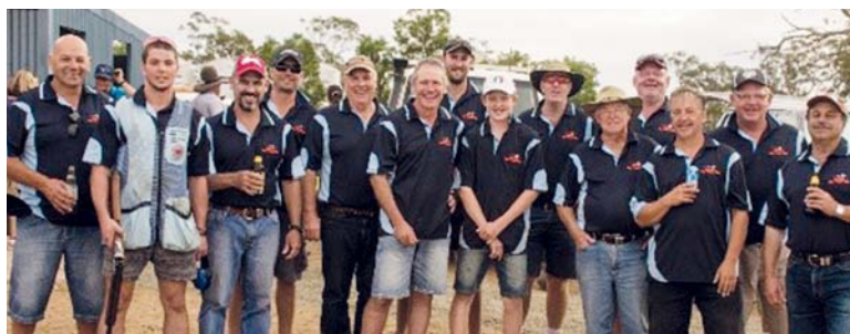
Orange Team Challenge winners

Sunday was another bright and sunny day that greeted shooters for the 25 Target Points Score Cash Divide. With a few sore heads the next day and a few Orange boys cowering from the sun, only 10 shooters split the prize money.