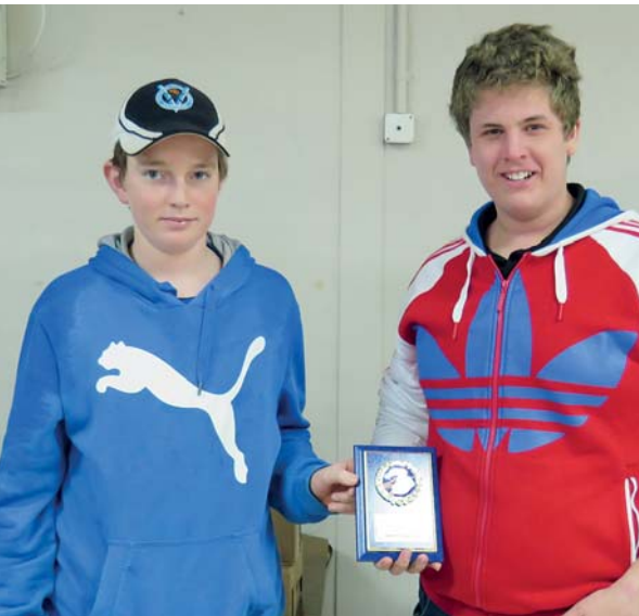
Melbourne Junior winning Team