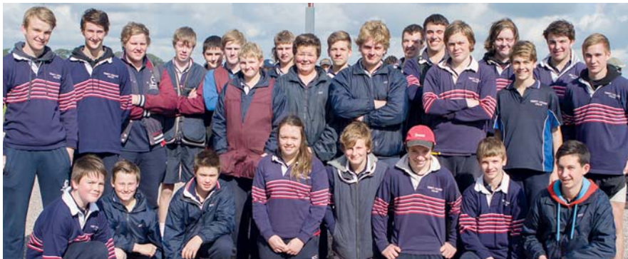
Trinity College Colac