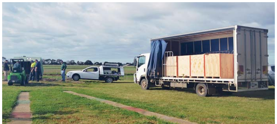
Installation of number 1 trap – taking out the old and installing the new