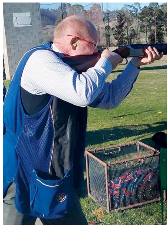
Eric Hutchinson, Federal Member for Lyons

There is a saying going round in the tourist industry "Tasmania, the go-to