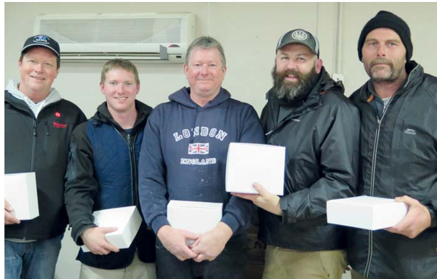
Mornington winning Team