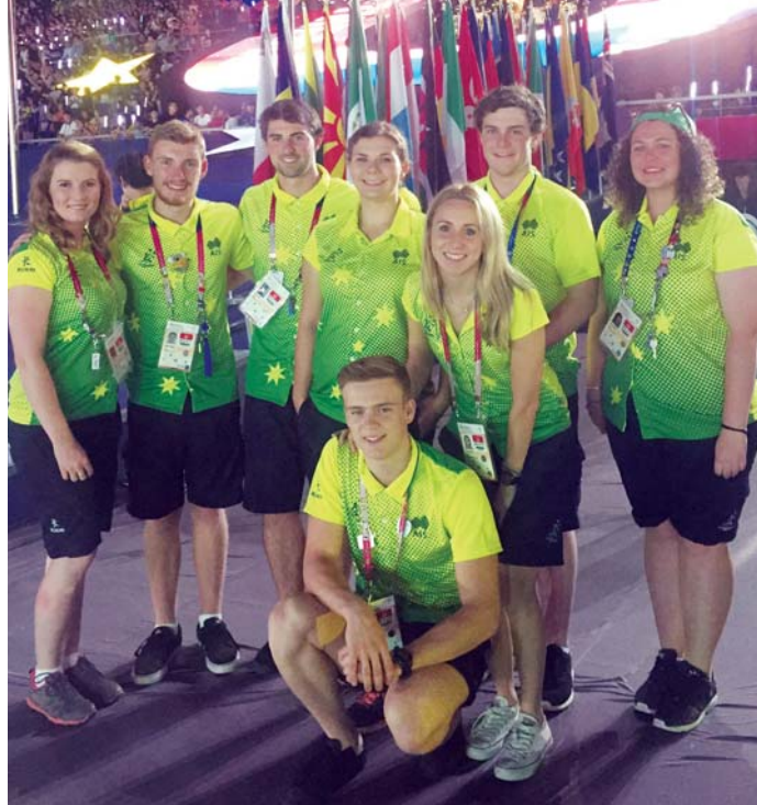
Games shooting team Rifle, Pistol and of course SHOTGUN at the opening ceremony

So who went and how did we go this year June/July in Gwangju, Korea?