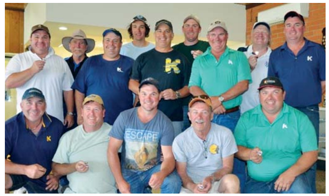
Open Postal Team