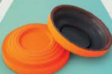
MIDI - ORANGE