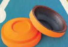
MINI - ORANGE