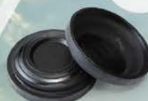
MIDI - BLACK