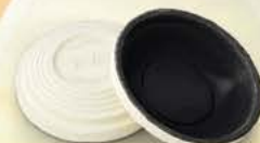
STANDARD - WHITE