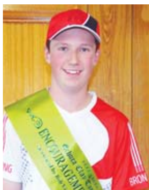
Charlie Cook Encouragement Award