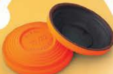
STANDARD - ORANGE