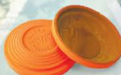
ECOSTAR LIGHT ORANGE