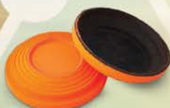
STANDARD FLASH - ORANGE