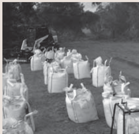
Bagged shot ready for recycling

Shooting ranges play an important role in our society. The benefits of recreational pursuits and community facilities are well documented, and town planners and land developers now have a strong focus on developing a sense of community in our living environments. Australia is internationally renowned for its shooting performance over many years. Competitive sports likewise play a key role in community development, also providing health and wellbeing benefits.