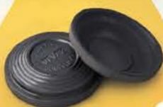
STANDARD - BLACK