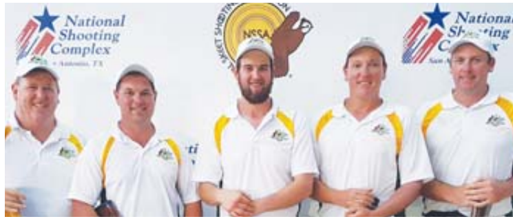
Australian skeet Team World Championships 2016

the targets under your belt in preparation for the World Championships.