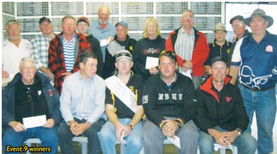
Event 9 winners