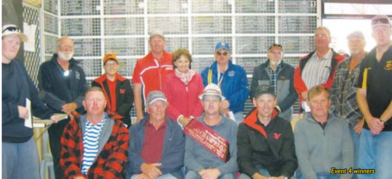
Event 4 winners