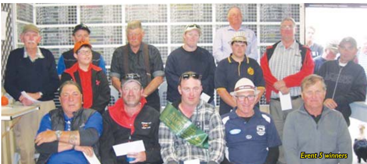
Event 5 winners