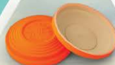
STANDARD NATURAL ORANGE