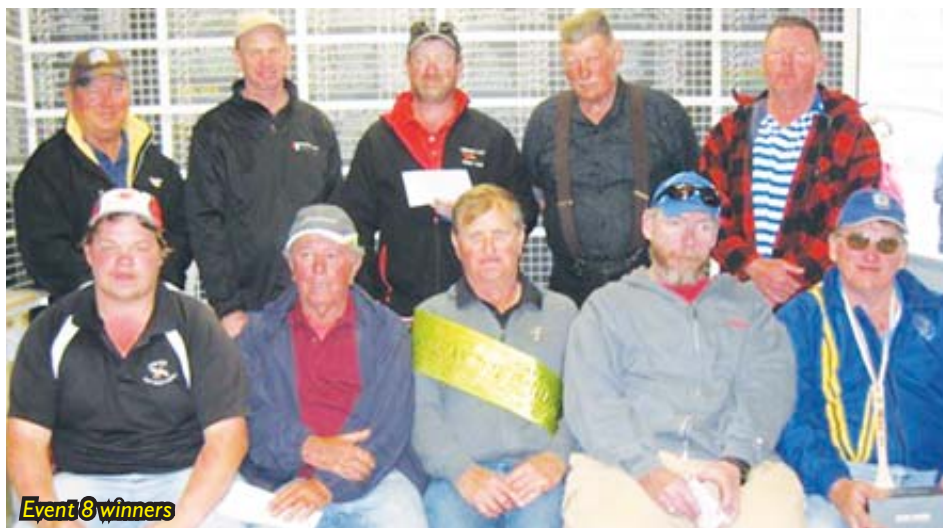
Event 8 winners