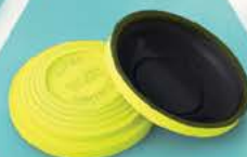
STANDARD - YELLOW