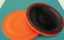
BATTUE - ORANGE