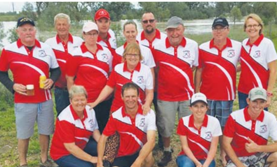
Above: Tambo Clay Target Club members and supporters. Below: High Gun winners

pallets across the racetrack so that shooters could walk to and from events without sinking into the mud!