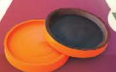
RABBIT - ORANGE