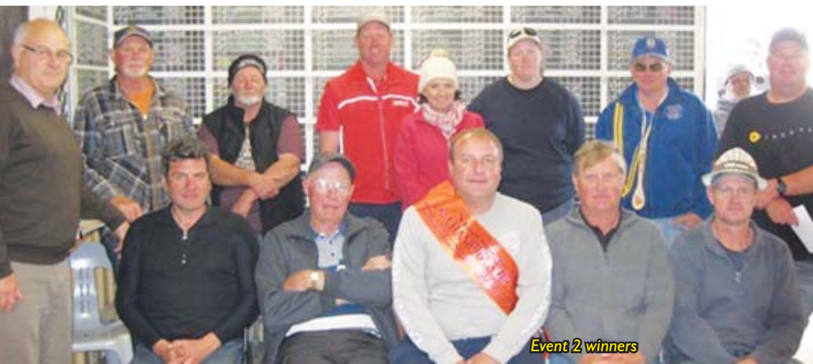
Event 2 winners