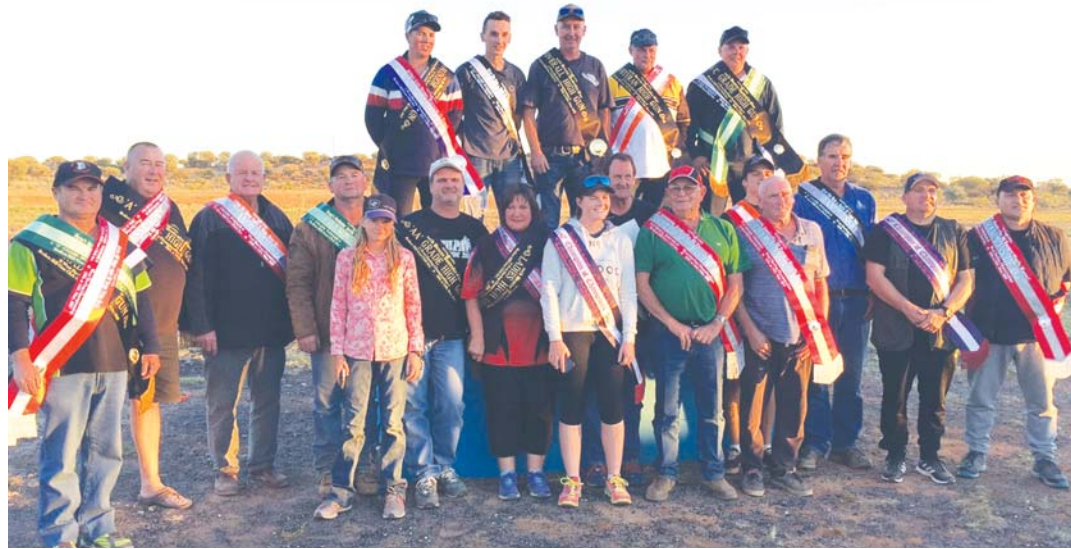
The many Sash and Trophy winners for the weekend