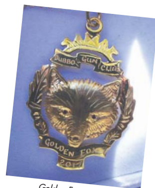
Golden Fox Badge

All in all an excellent weekend of shooting was had by all, the Dubbo Gun