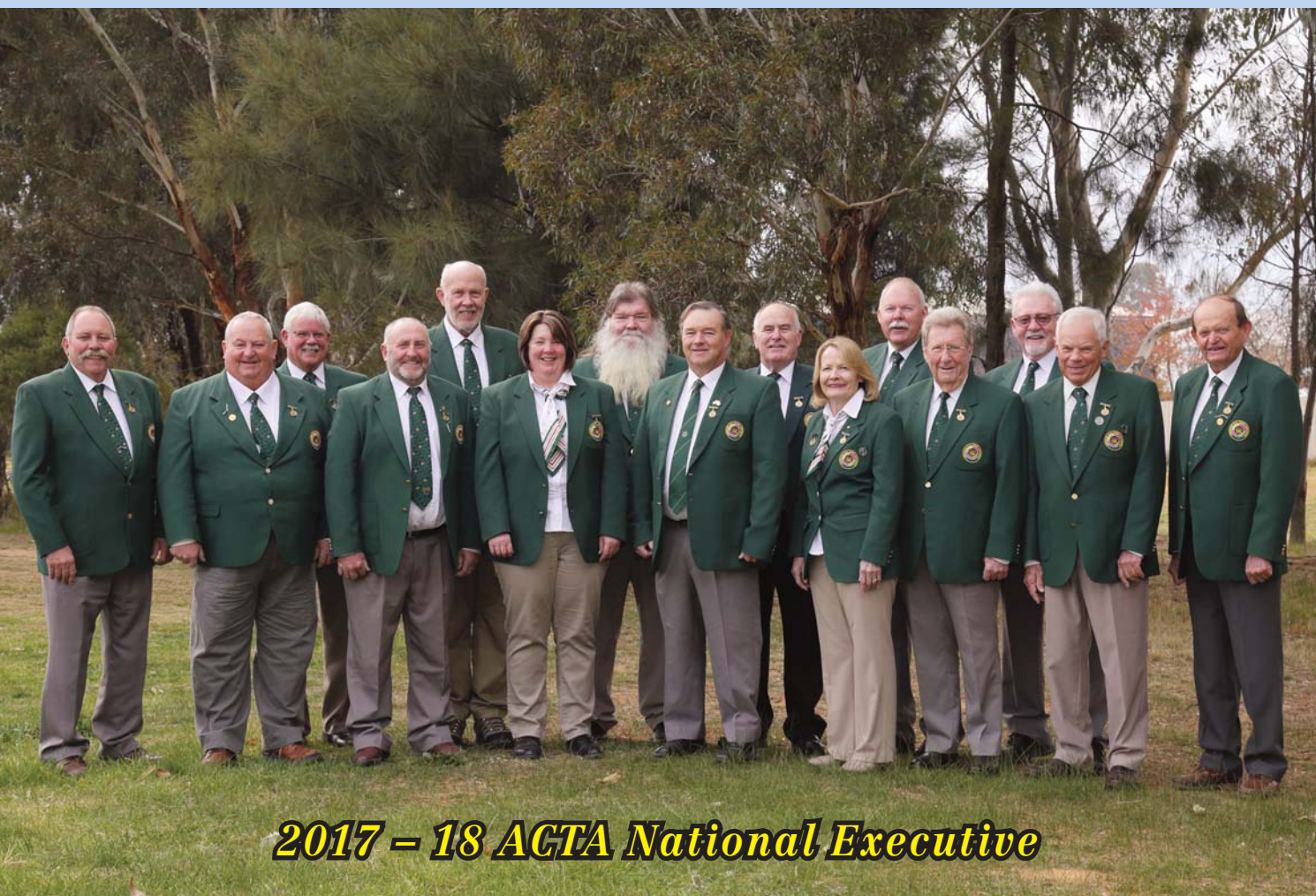
2017 – 18 ACTA National Executive

QCTA STATE TRAP CARNIVAL – Gemfields Gun Club ACTA NEWS – National Trap & World DTL Championships National ACTA Sporting Clays Championship program Monarto CTC 35th Anniversary