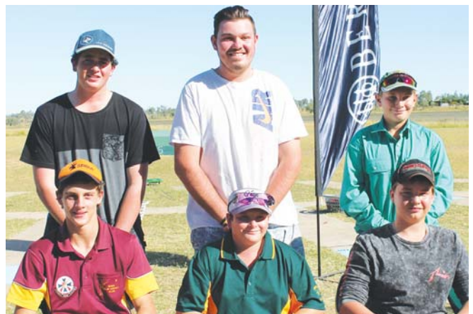
Queensland Juniors Postal Team