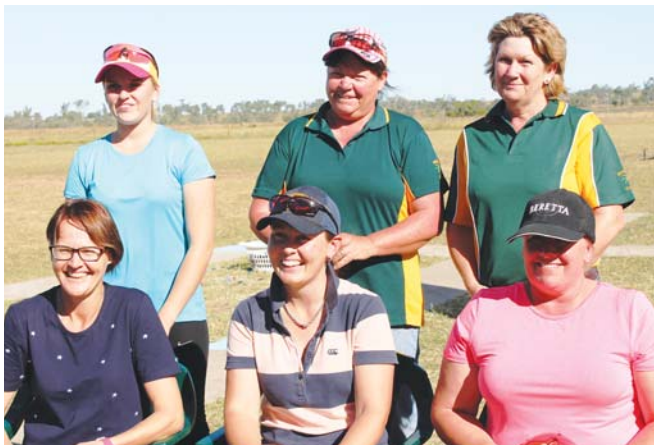
Queensland Ladies Postal Team