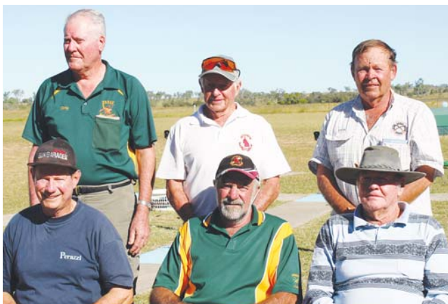
Queensland Veterans Postal Team