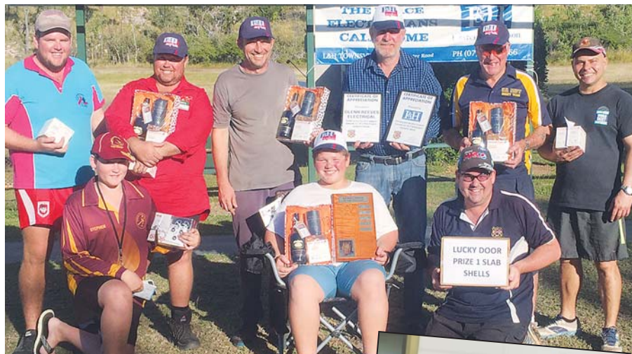
Above: Bob Rogers Memorial winners

On Sunday we hosted the 100t Bob Rogers Memorial Skeet. The event was sponsored by Glenn Reeves Electrical and L & H Electrical Whole-