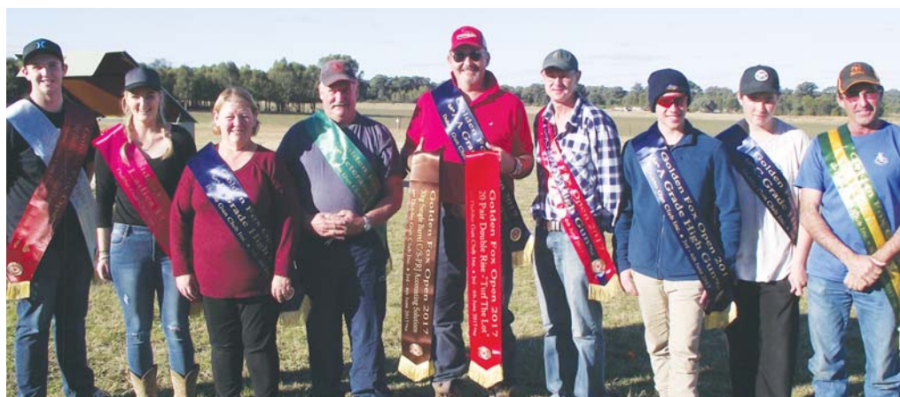
High Gun Winners