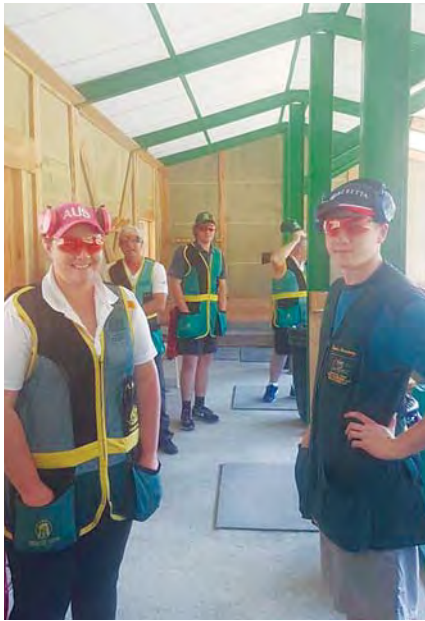
The strange layouts in Megeve where you virtually shoot inside a hut