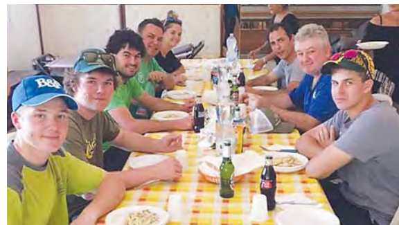
Lunch at the Gun Club in Terni

A fantastic trip with fantastic people. If you are an ISSF shooter keen on your sport and haven't ventured to Italy to shoot then make sure it is on your bucket list and make sure you get to Umbriaverde!!