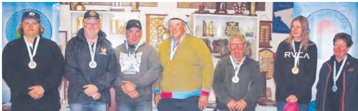
Doubles CS Grade winners