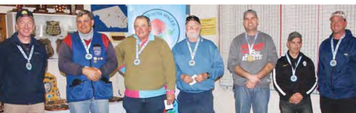
20 Gauge CS Grade winners