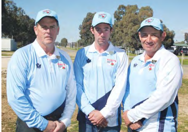
New South Wales