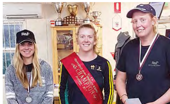
Women's Trap OA Winners