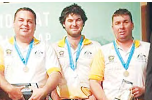
Our Senior team collecting a bronze medal