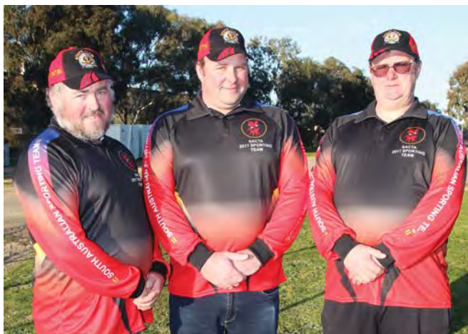
South Australia Queensland