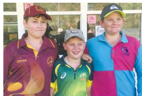
Northern Zone Junior Team