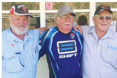
Northern Zone Veteran Team