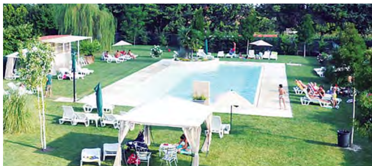
The pool at the shooting range at Umbriaverde