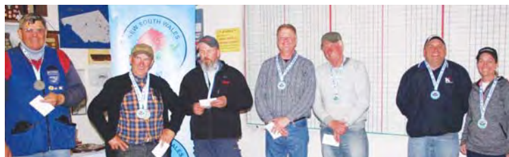
410 Bore CS Grade winners