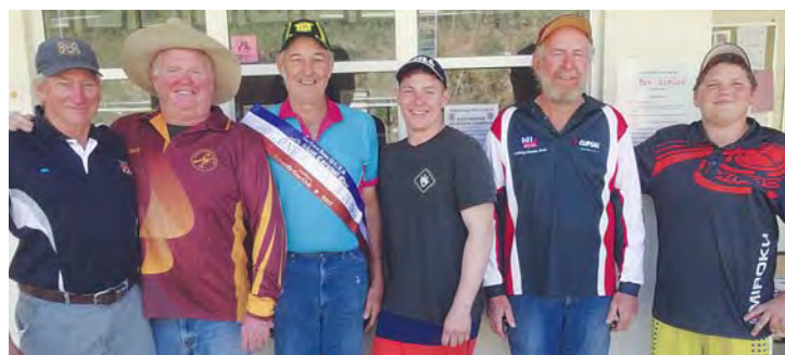
Northern Zone Open Team