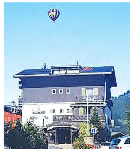
Our home in Megeve Hotel au Coin du Feu