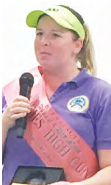
Lauren Love Ladies HG