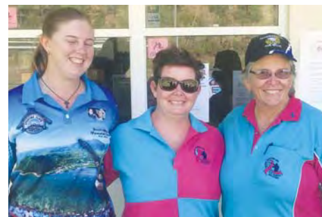
Northern Zone Ladies Team