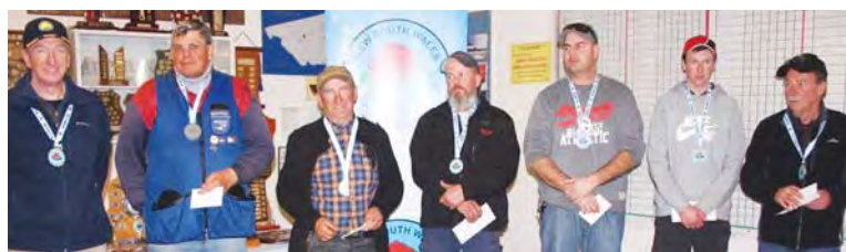
28 Gauge CS Grade winners