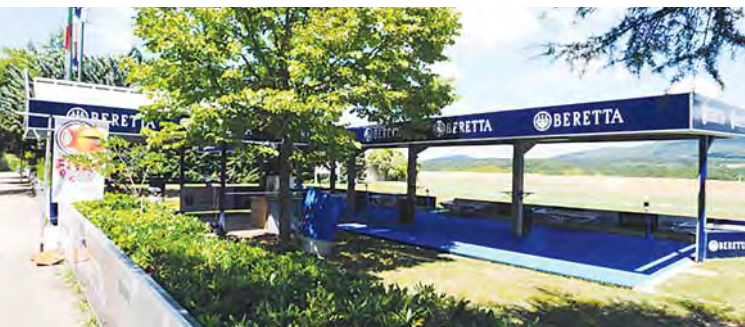
The main shooting range at Umbriaverde