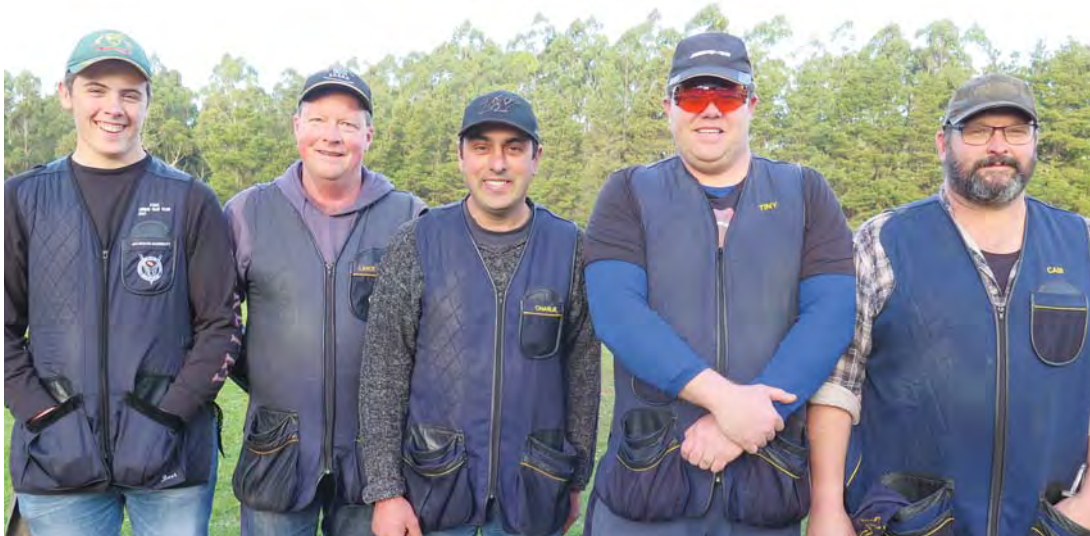
Winning Team Mornington Red

The Zone would like to recognise and thank Beretta for their ongoing sponsorship of the daily High Gun trophies, which they provide for all venues for the year during the Series.