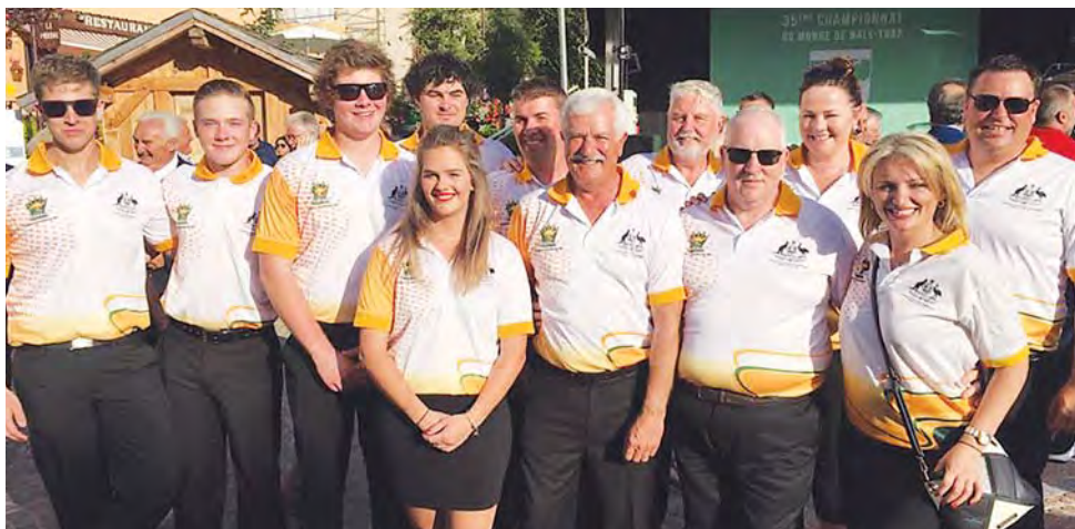
Our Australian team at the opening ceremony

The 14 who had a private bus had a trip to remember. 2 drivers were sent to rotate the driving as it was to be a 10 hour trip. On arriving the 15 seat bus had one seat that was a permanent disabled wheel chair type seat that none of our crew were going to fit in. This saw our spare driver seat himself in the isle of the bus!!! Probably should have been our first warning. The first 4 hours of the trip all went smoothly with most of