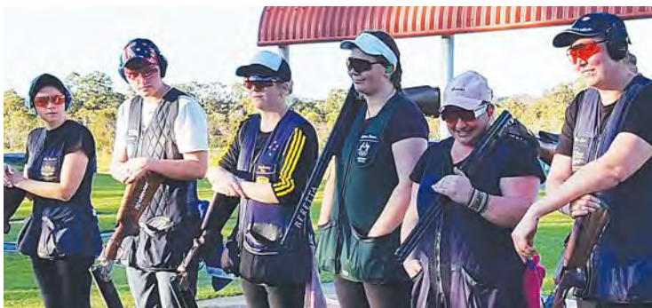
Women's Trap Final Line-Up