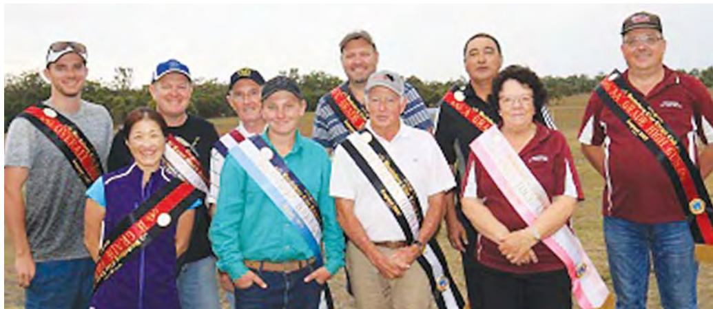
High Gun winners