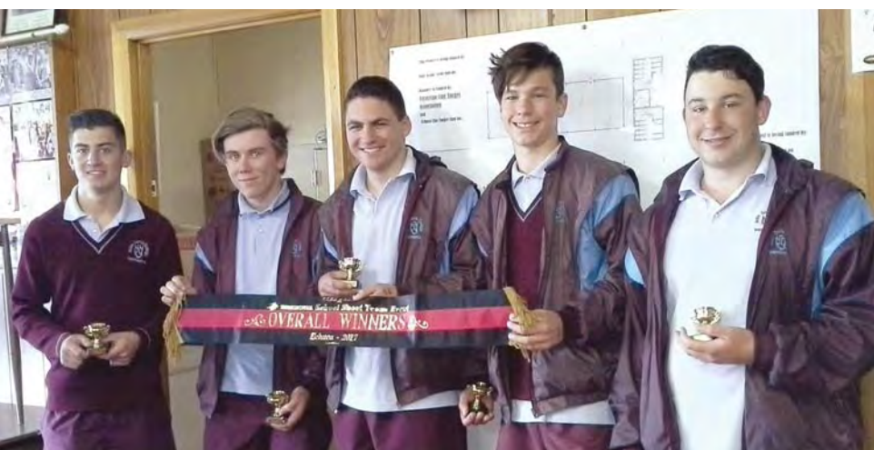
Winning Team, Notre Dame College Shepparton