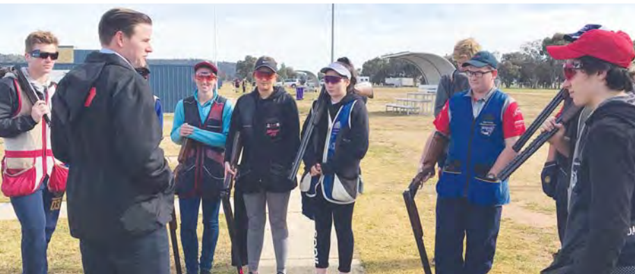
Prime 7 discussing with shooters

priority so the lads could get back to shooting.