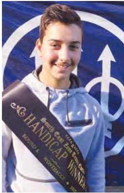
Accaio Moto 1st HC

On Sunday 13th August with a clear sky and no wind 97 shooters nomed for the second last round of the 2017 series. With only the Carnival left to run at Frankston Australian on Saturday 14th of October.